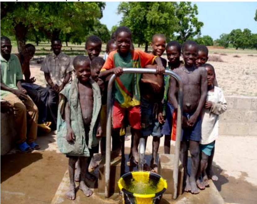
Community members pumping clean, safe drinking water from their new and reliable water source.