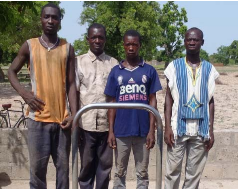
Water committee members responsible for maintaining the well and who were provided with a LWI Burkina Faso contact number in case their well were to fall into disrepair, become subject to vandalism or theft.