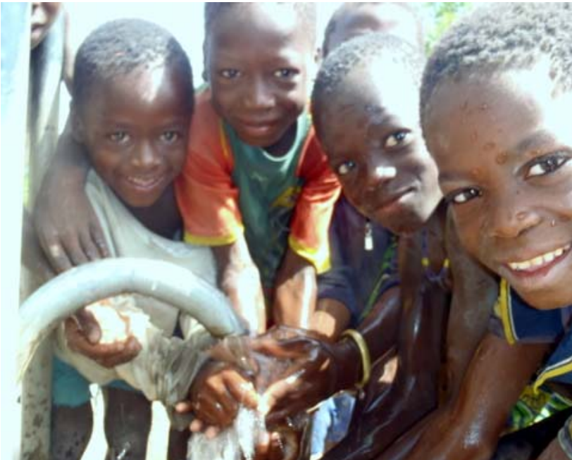
Community children pumping clean, safe drinking water.