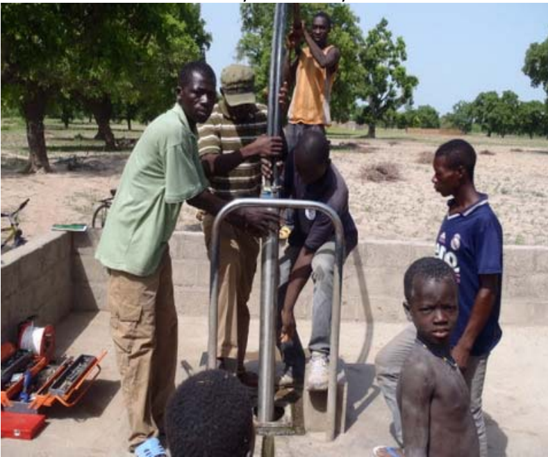
Project in process. Community members assisted the LWI Burkina Faso team with the water project whenever possible.