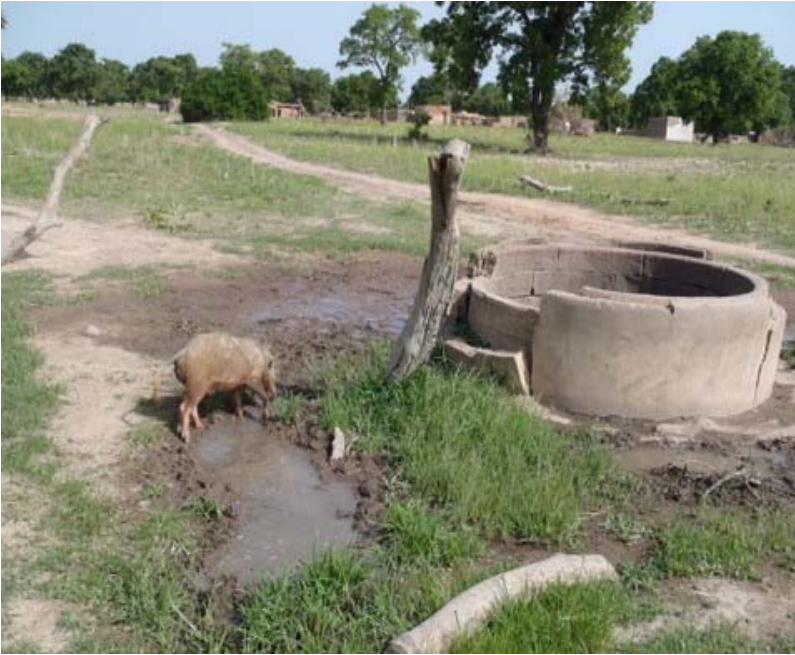
Previous water source used by community members and shared with the local livestock.