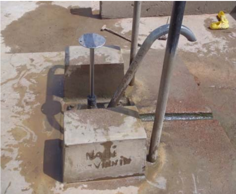
Completed water project.